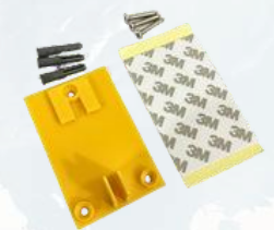
4) Secondary Stabilizer (Sold separately)