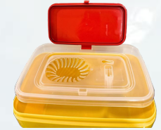
2) Cover with lid